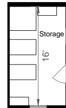
SHED 170 SQ FT

Estimated Total Square Footage: 6,680 SQ FT Calculated from outside face of exterior walls.