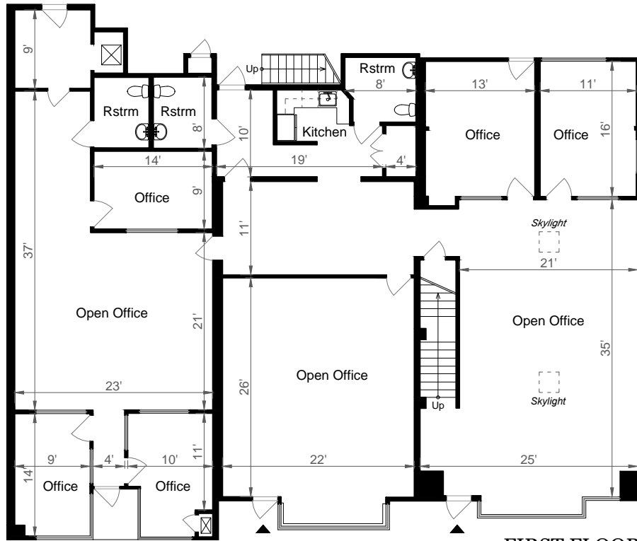
FIRST FLOOR 3,985 SQ FT