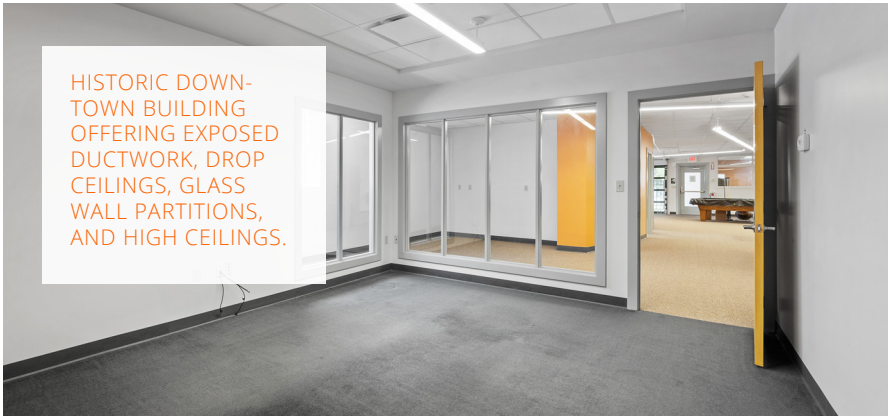
HISTORIC DOWNTOWN BUILDING OFFERING EXPOSED DUCTWORK, DROP CEILINGS, GLASS WALL PARTITIONS, AND HIGH CEILINGS.