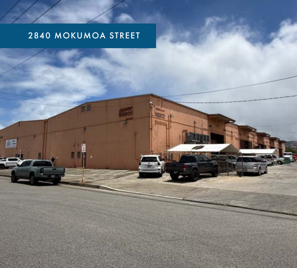
2840 MOKUMOA STREET