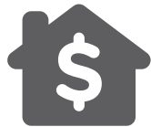
Average HH Income