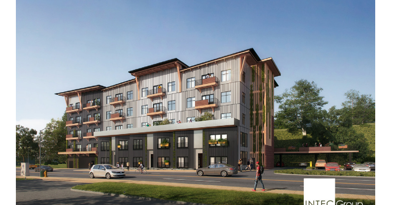
RENDERING OF THE MULTIFAMILY STRUCTURE