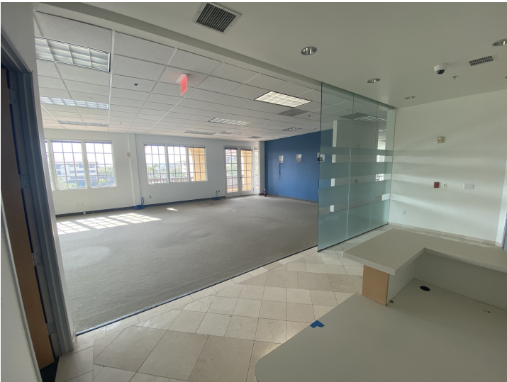
Open Plan Office