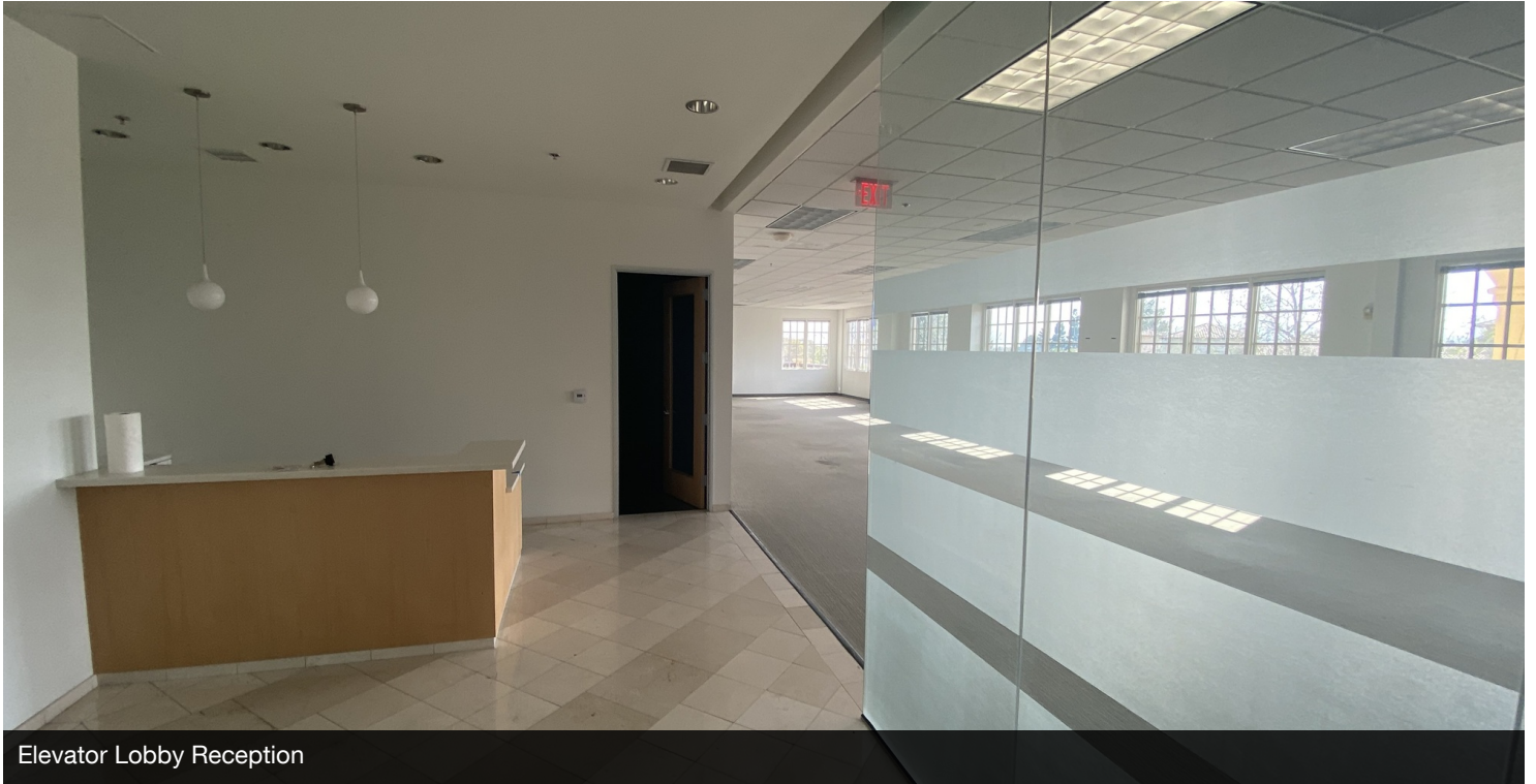
Elevator Lobby Reception