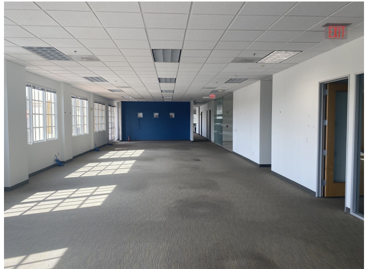
Open Plan Office