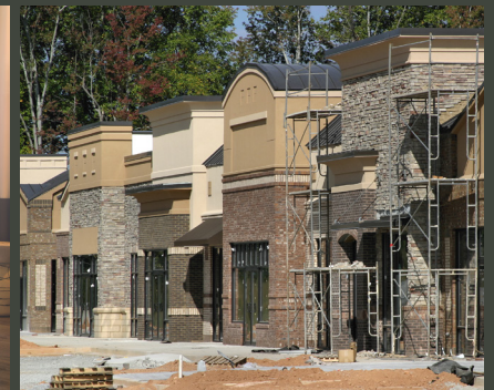
BUILD TO SUIT

This is a Marketing Communication: the information contained herein has been obtained from sources believed to be reliable. Though we have no reason to doubt its accuracy, we have not verified it and make no guarantee, warranty, or representation about it. Any projections, opinions, assumptions or estimates used are for example only. They do not represent the current or future performance of the property. For interested parties: we do not guarantee the suitability of the property for your needs. You and your advisors should conduct a careful, independent investigation of the property. Photos, graphics and logos contained herein are the property of their respective owners. The use of these images without the express written consent of the owner is prohibited.