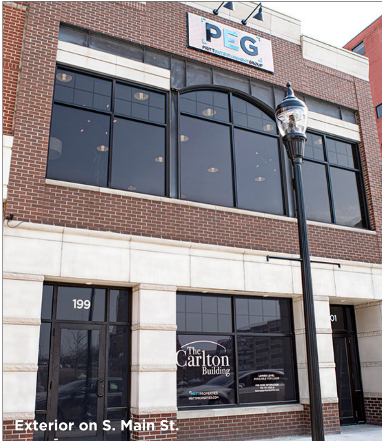
Exterior on S. Main St.