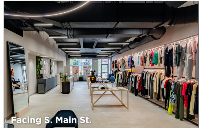
Facing S. Main St.