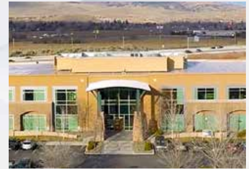
10345 Professional Circle, Reno 64,360 SF Class A Office