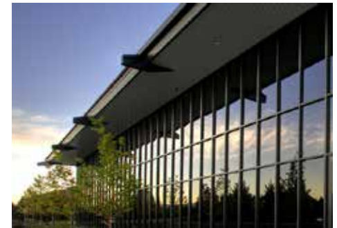
5390 Kietzke Lane, Reno 65,917 SF Class A Office