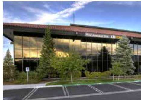
5310 Kietzke Lane, Reno 55,387 SF Class A Office