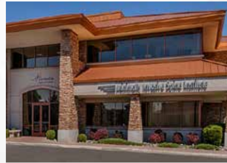
9990 Double R Blvd., Reno 20,549 SF Class A Commercial Office and Medical Building

NevDex Properties is Reno's premier landlord for Class A office space. We develop, own and manage approximately 420,000 rentable square feet in Reno, Nevada, including the NevDex Office Park. By providing creative deal structures with flexible lease terms, expansion rights and landlord sponsored improvement dollars, we offer the most professional and flexible leasing solutions that can help you thrive in today's rapidly changing work environment.