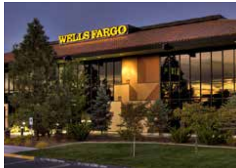
5340 Kietzke Lane, Reno 55,917 SF Class A Office