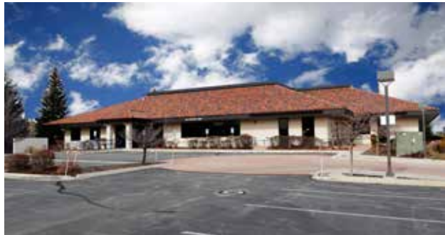
5411 Kietzke Lane, Reno 14,918 SF Class A Office/Medical