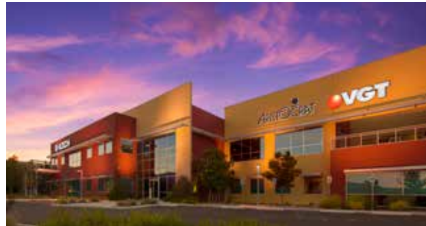
887 Trademark Drive, Reno 53,437 SF Class A Office