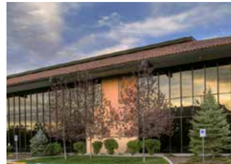
5370 Kietzke Lane, Reno 55,559 SF Class A Office