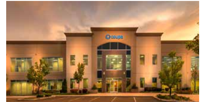
10615 Professional Circle, Reno 46,810 SF Class A Office