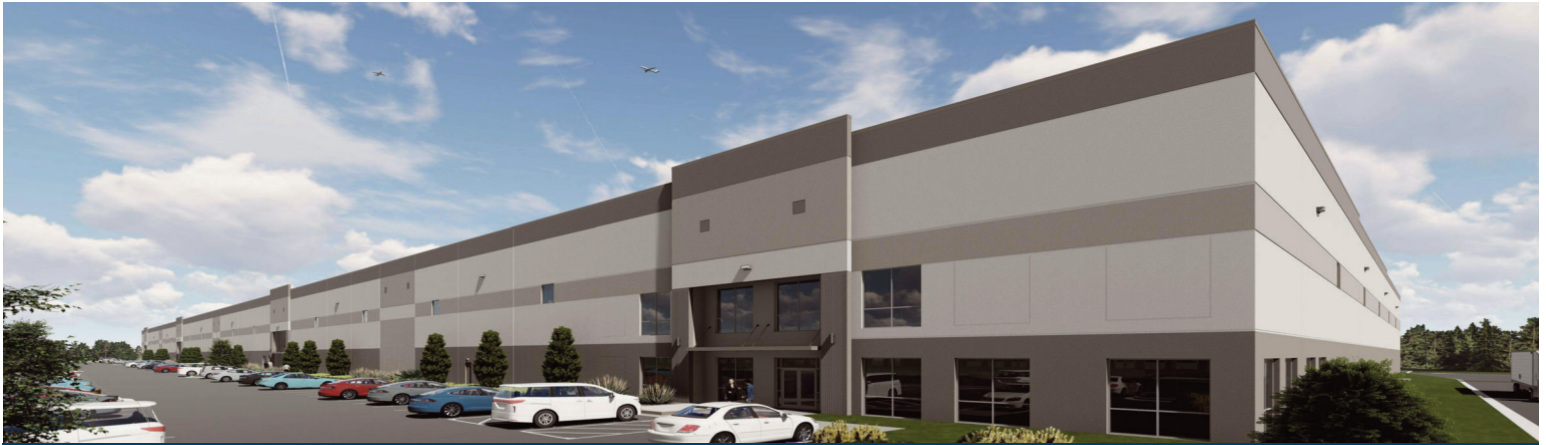
18139 Logistics Parkway, NE | Covington, GA 30014