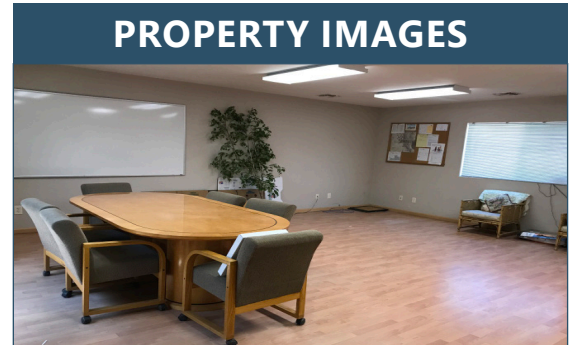
Office and Conference Room