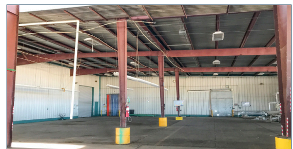
Attached Shade Area

760.360.8200 | DesertPacificProperties.com | 77-933 Las Montanas Rd. Suite 101 Palm Desert CA 92211