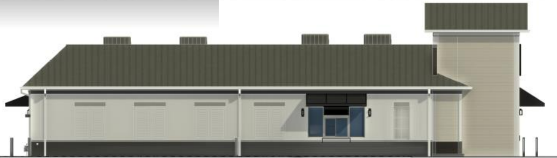
① EAST ELEVATION Scale: 3/16" = 1'-0"