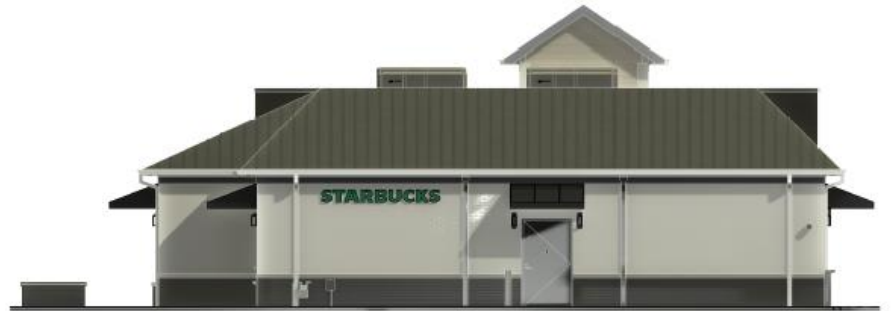
③ SOUTH ELEVATION Scale: 3/16" = 1'-0"