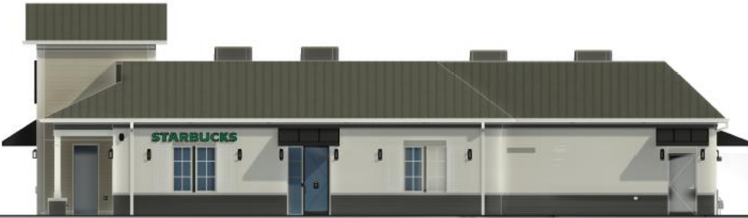
④ WEST ELEVATION Scale: 3/16" = 1'-0"