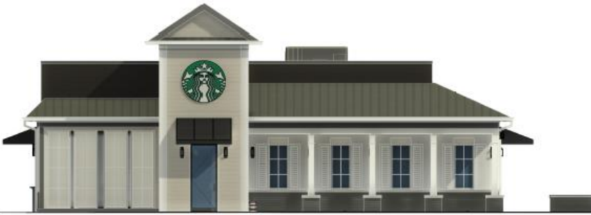
② NORTH ELEVATION Scale: 3/16" = 1'-0"