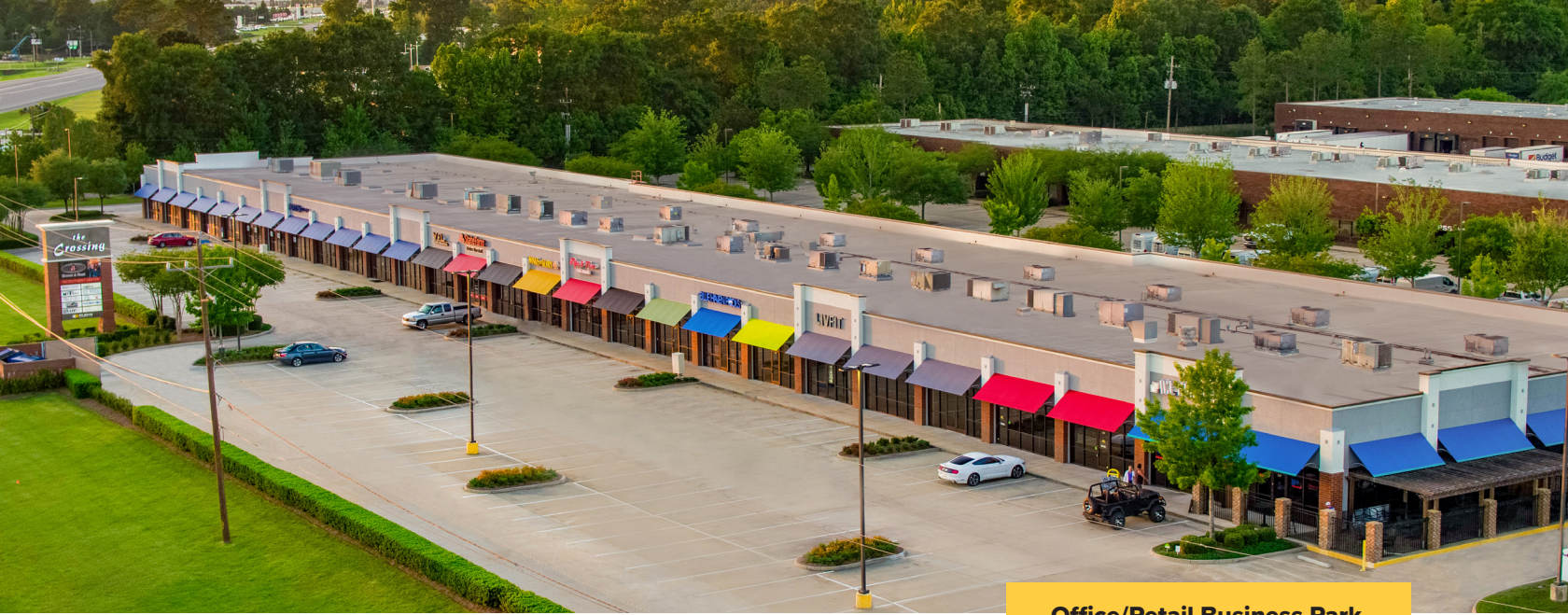
Office/Retail Business Park