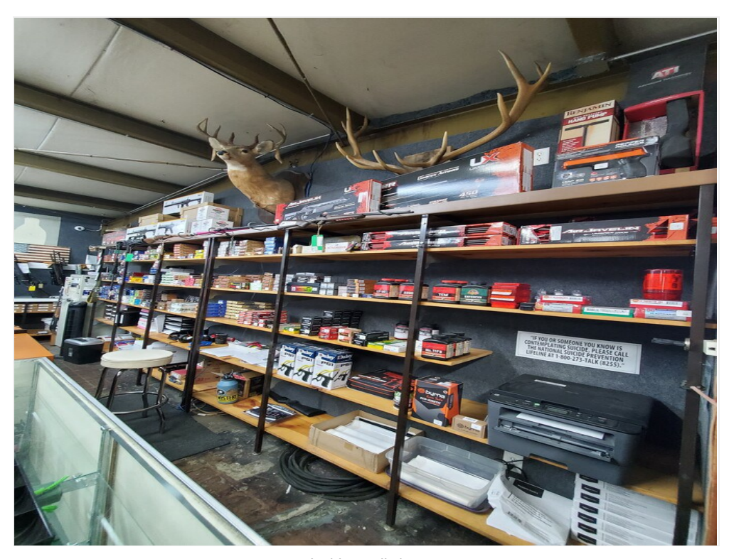
Inside retail shop