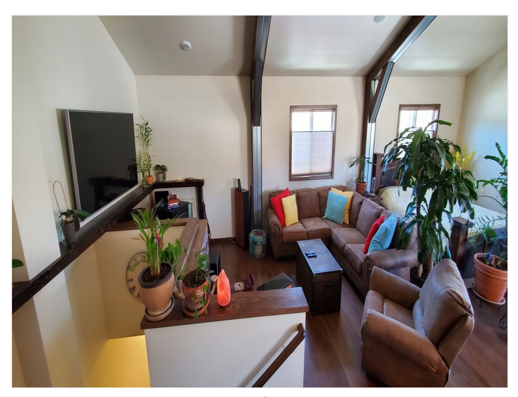
100 yr old yellow pine floors