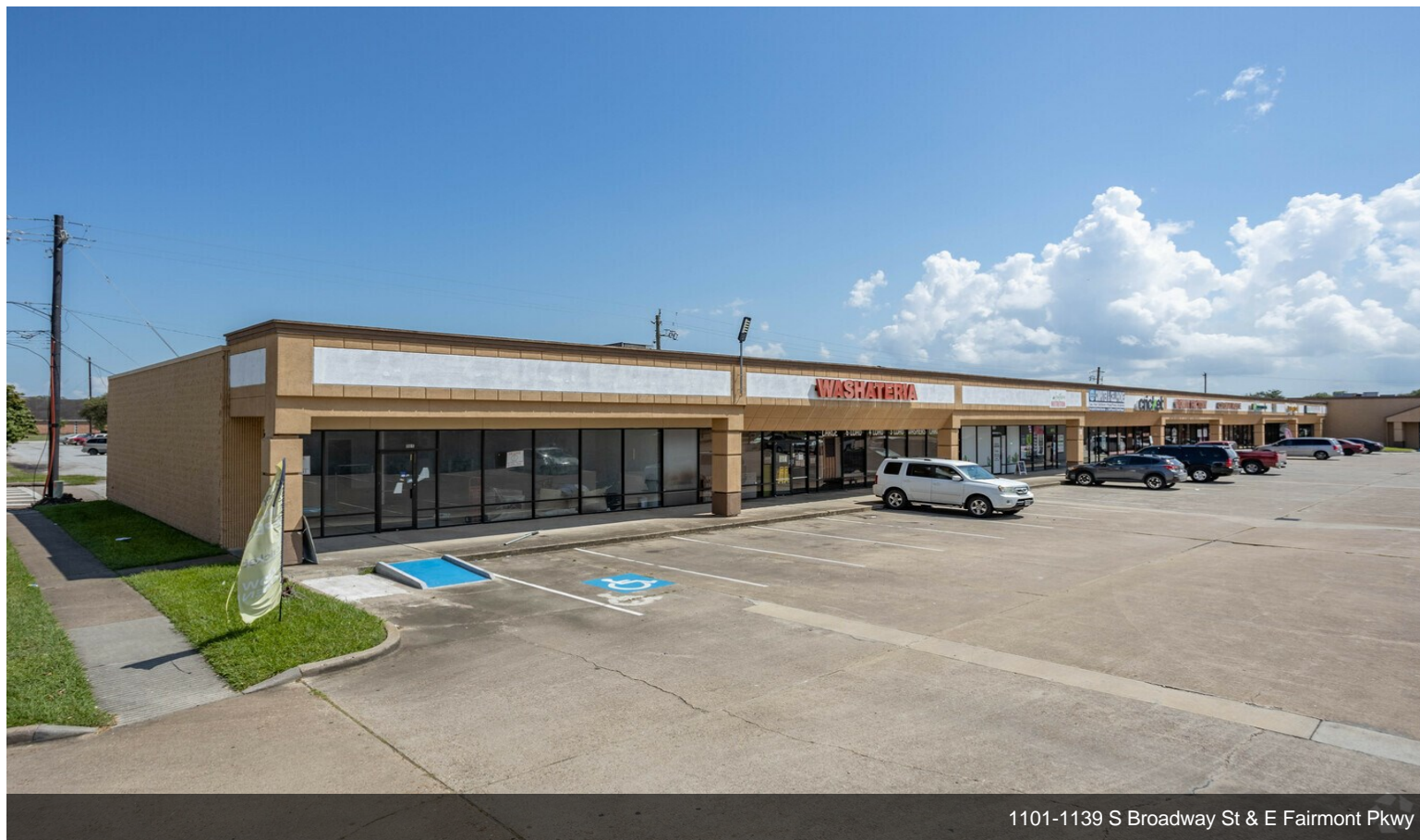
1101-1139 S Broadway St & E Fairmont Pkwy