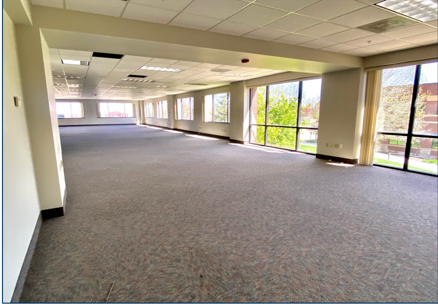
Suite 240 Interior