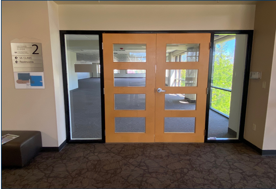
Suite 240 Entry