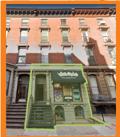
SITE: 2037 WALNUT STREET

JOE SCARPONE 267.546.1721 ■ joescarpone@mpnrealty.com