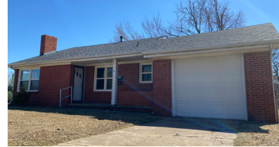
111 E Independence Shawnee, OK 74804 2 BR / 1 BA 975 square feet