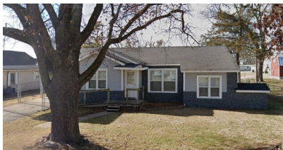
210 Smith Ave Dale, OK 74851 2 BR / 1 BA 1,088 square feet