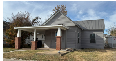
932 N Louisa Shawnee, OK 74801 2 BR / 1 BA 878 square feet