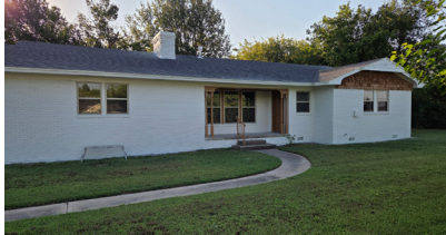
505 S Rangeline Tecumseh, OK 74873 3 BR / 2 BA 1,481 square feet