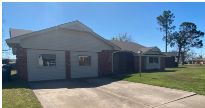
4201 N Aydelotte Shawnee, OK 74804 4 BR / 1.5 BA 1,716 square feet