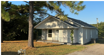
1520 N Tucker Shawnee, OK 74801 3 BR / 2 BA 1,514 square feet