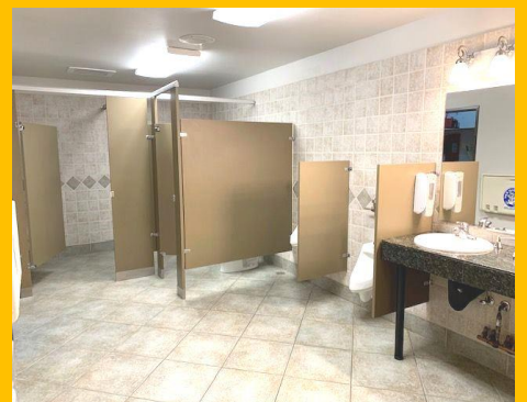
Three Accessible Restrooms Plus One Additional Single Restroom