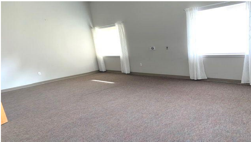
Three Offices/ Private Rooms