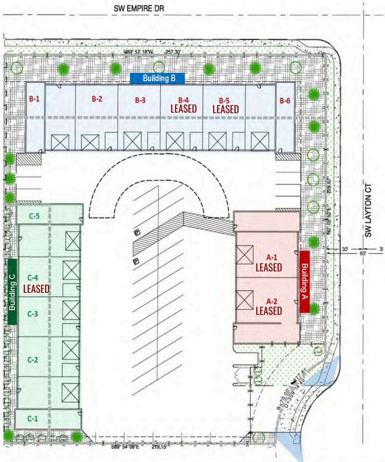
LAYTON COURT INDUSTRIAL CONDOMINIUM COMPLEX