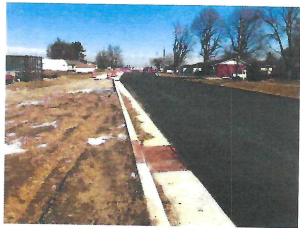
North along S. 4 th Street / Burkhart Blvd. extension