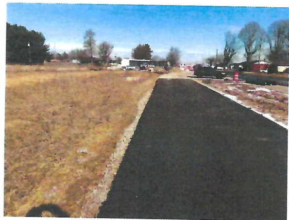
North along pedestrian path