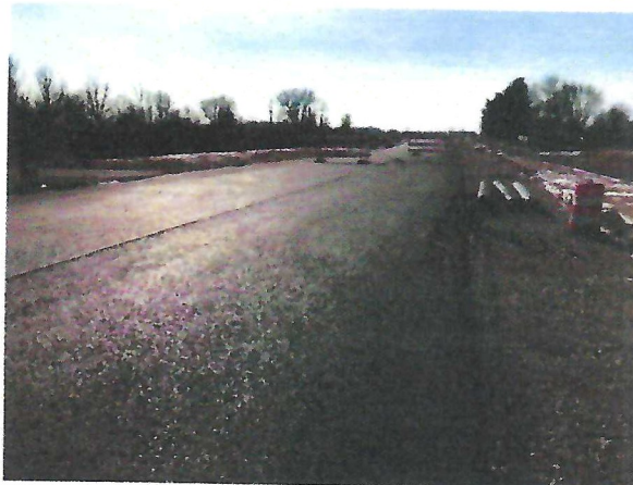
South along S. 4 th Street / Burkhart Blvd. extension