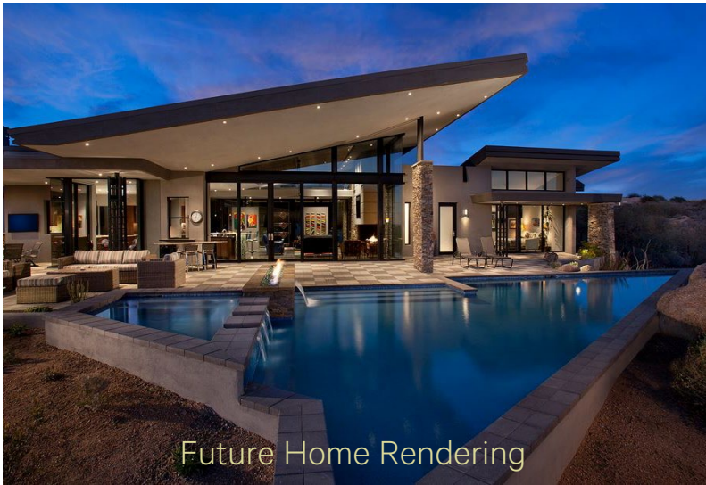
Future Home Rendering