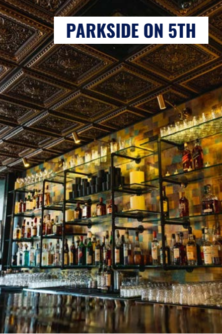
PARKSIDE ON 5TH