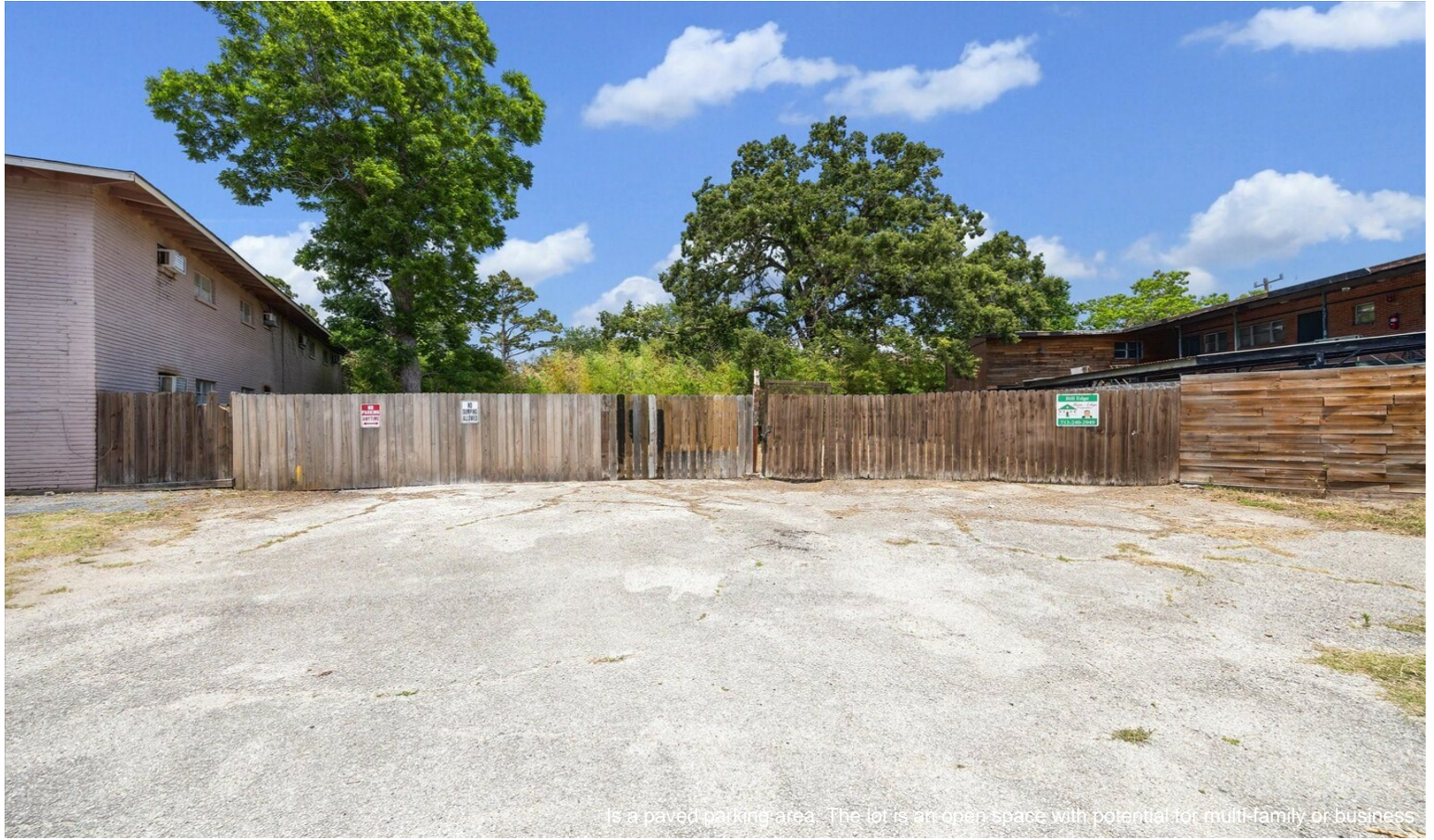
Is a paved parking area. The lot is an open space with potential for multi-family or business