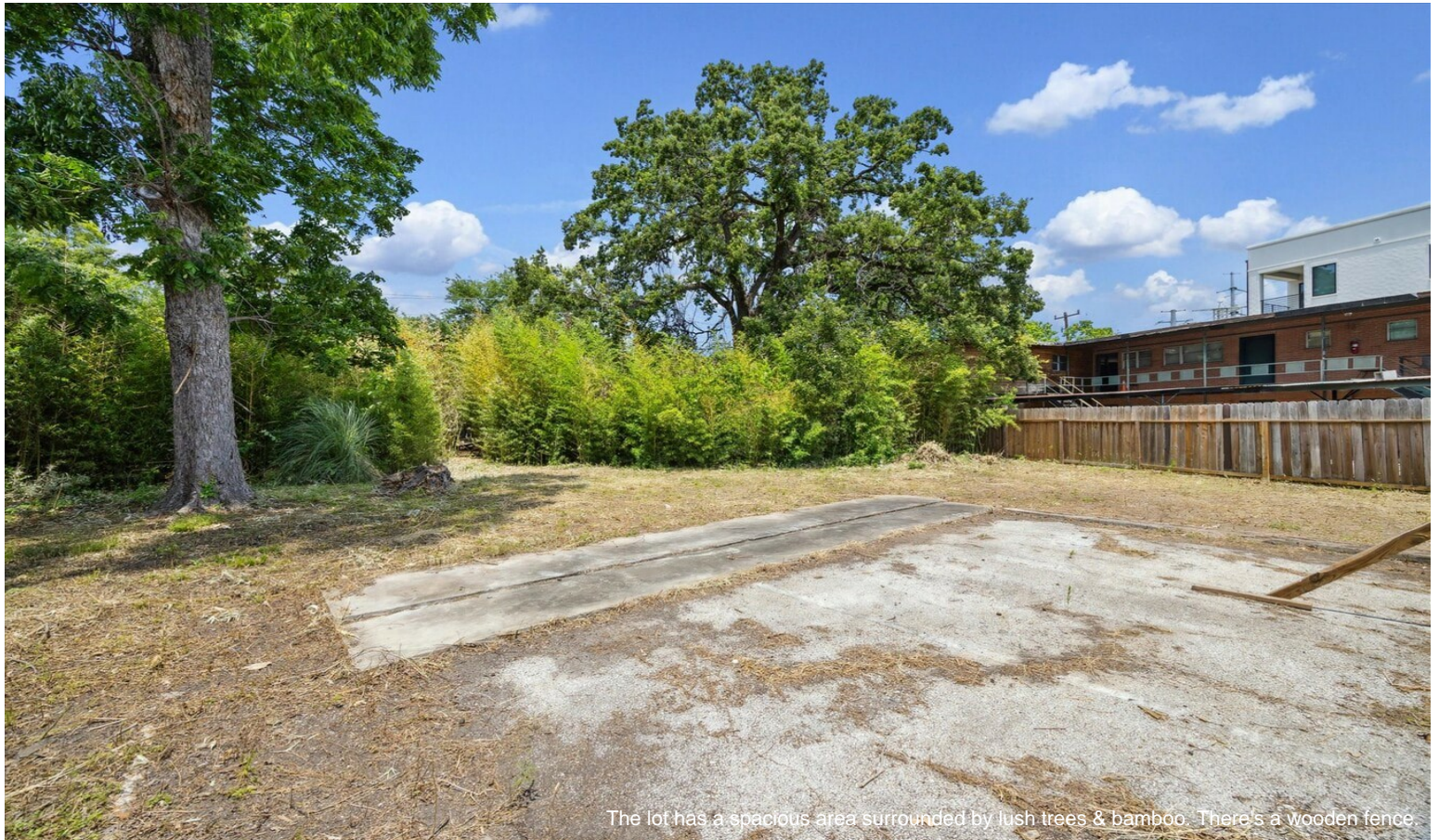
The lot has a spacious area surrounded by lush trees & bamboo. There's a wooden fence.