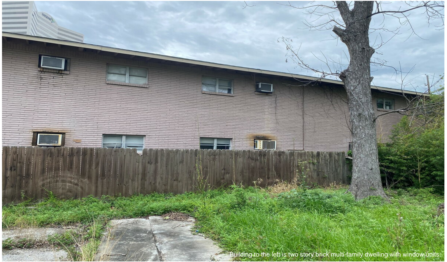
Building to the left is two story brick multi-family dwelling with window units.