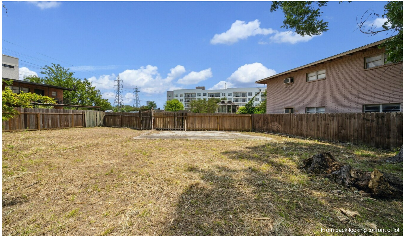
From back looking to front of lot