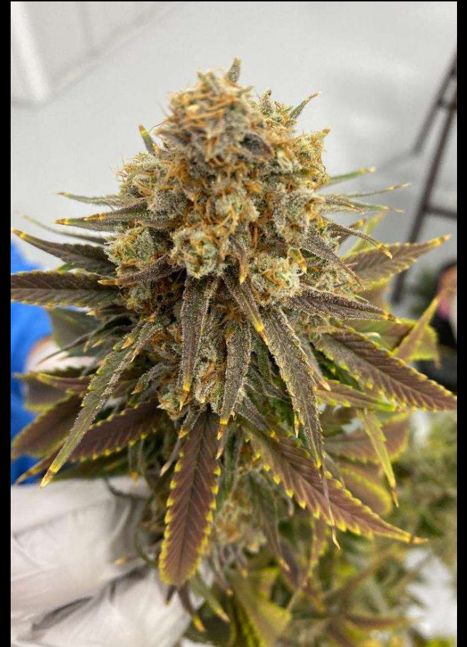
HG Acapulco Gold