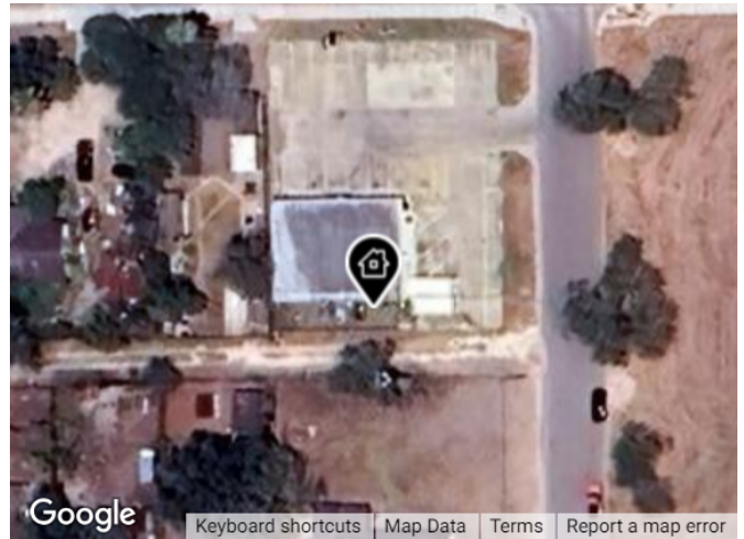
Legend: Subject Property