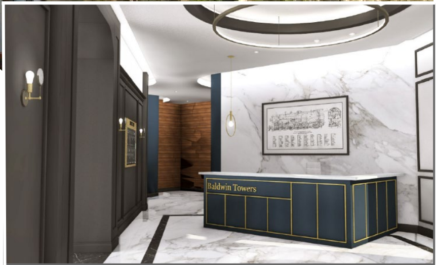
Planned Lobby Renovation