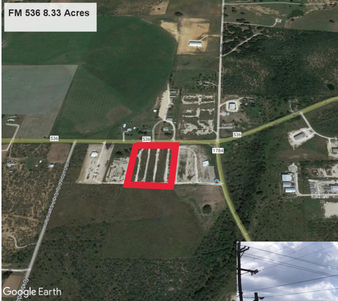
FM 536 8.33 Acres