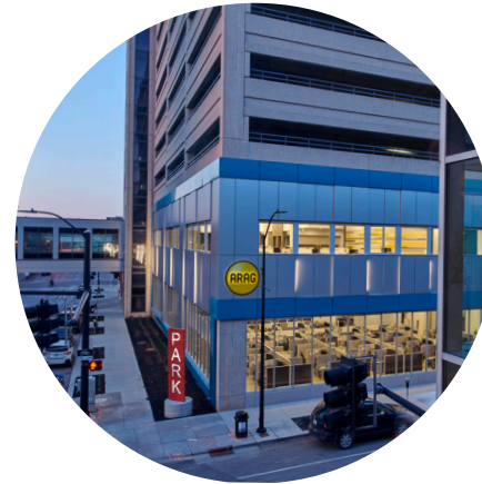
newly renovated exterior