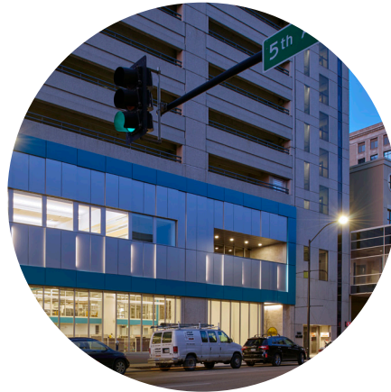
street level presence