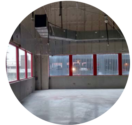
start with a clean slate