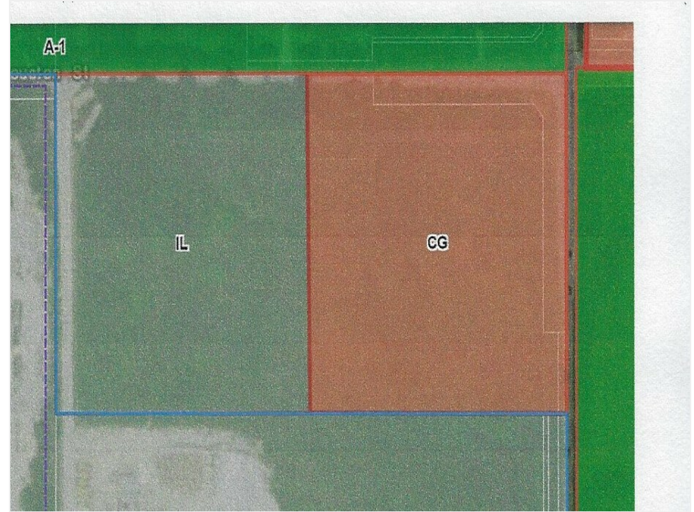
81st & 193rd Zoning (2)