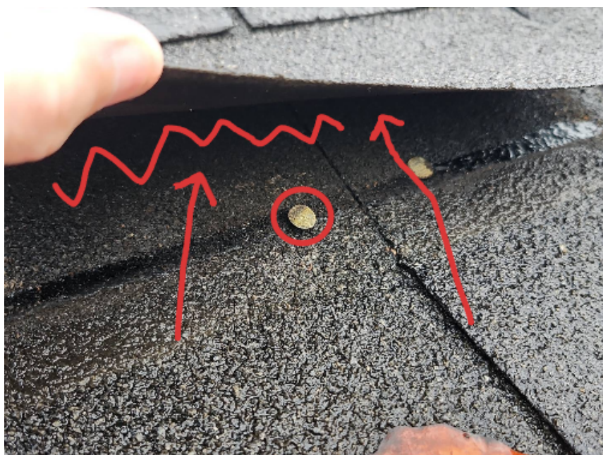
Seal failure and nail pop. Nails are installed properly in nailing strip in this picture.