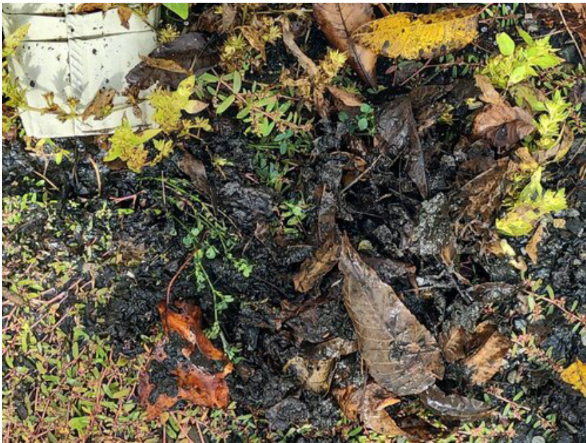
Debris from gutter when clogged removed