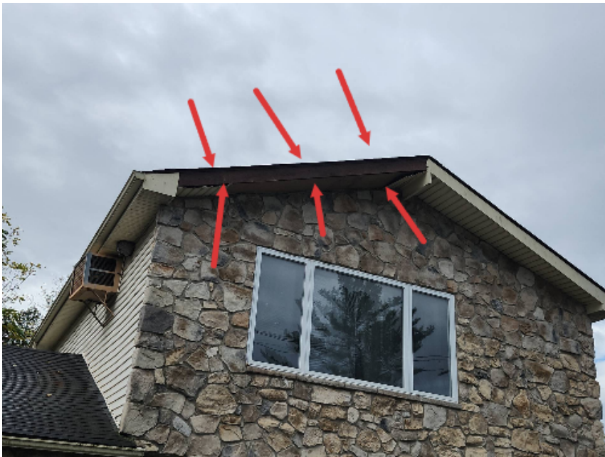
Missing soffit and fascia