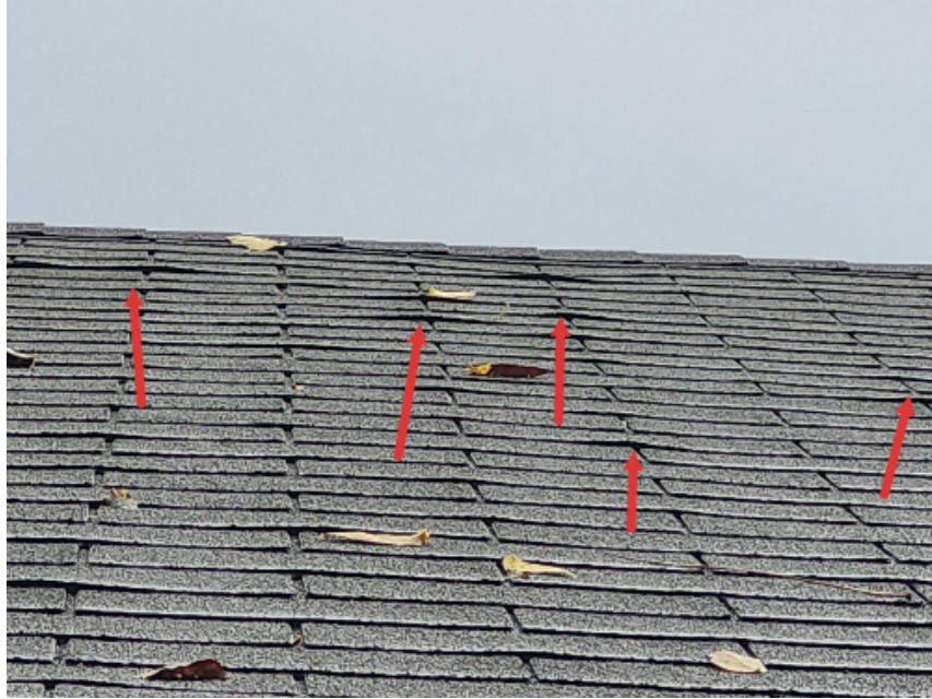
Shingle seal failure resulting in shingle lifting