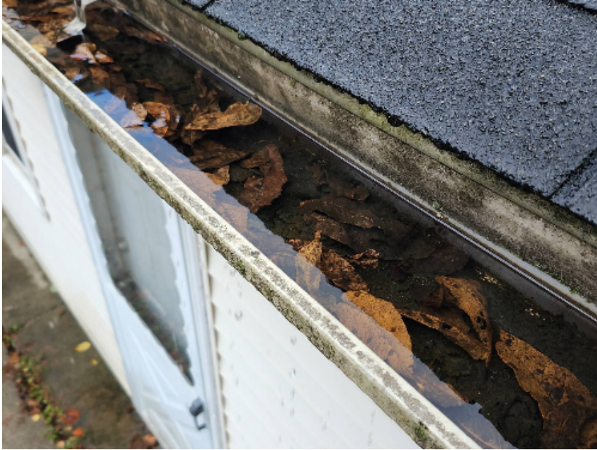
Gutter filled with water