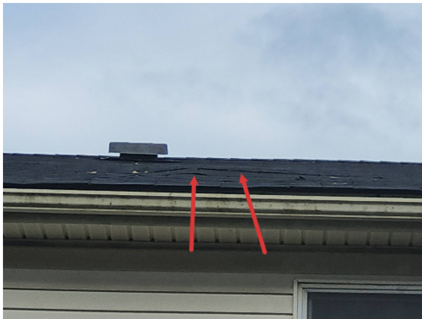
Additional shingle lifting