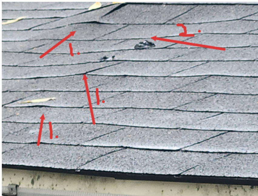
More rippling (1) and some soft spots (2) in deck of roof were observed.