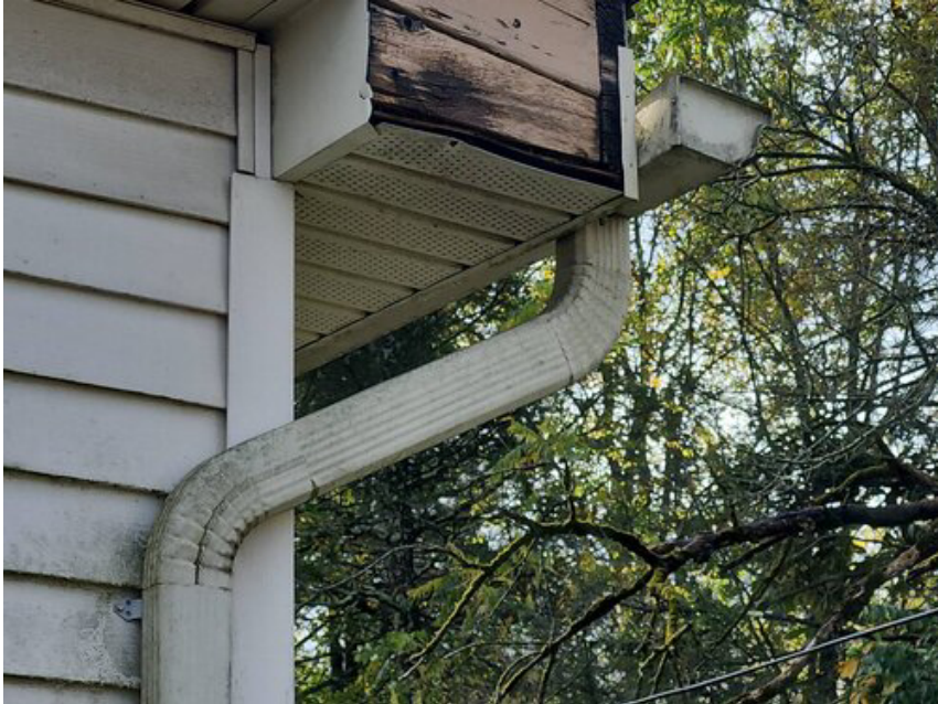
Missing fascia that will lead to wood rot