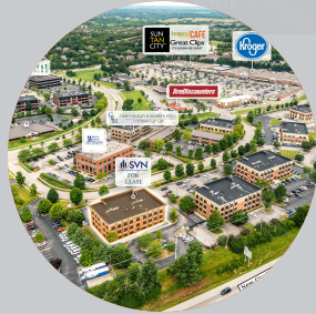
RETAIL & RESTAURANTS NEARBY