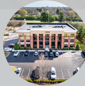
BEAUMONT PROFESSIONAL AREA