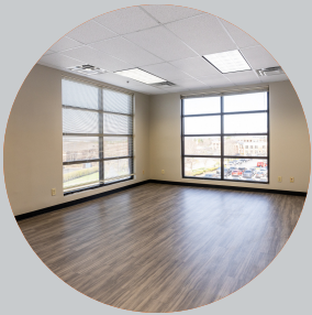
BRIGHT, RENOVATED OFFICES WITH WINDOWS