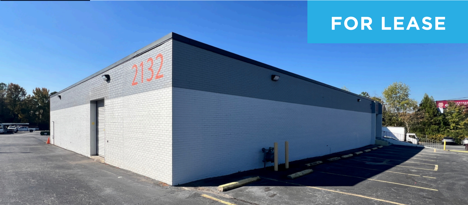
FRONTAGE ALONG JAMES JACKSON PERFECT FOR SHOWROOM USER WITH IN TOWN EXPOSURE