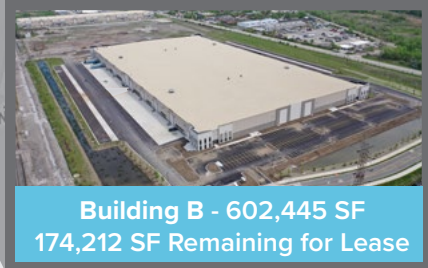
Building B - 602,445 SF 174,212 SF Remaining for Lease