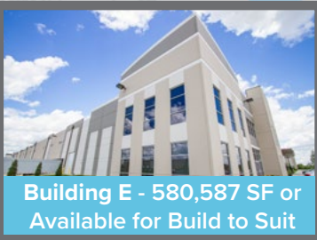
Building E - 580,587 SF or Available for Build to Suit