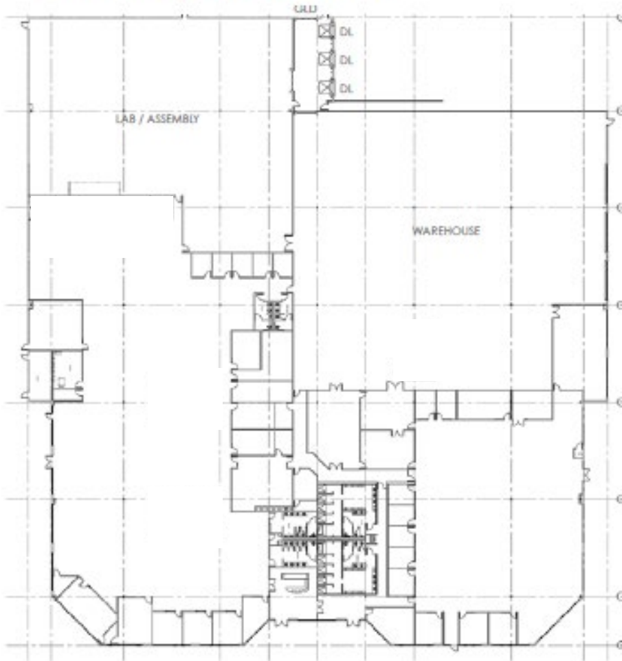
Floor Plan Layout to be Confirmed

RARE SINGLE STORY FREESTANDING R&D/FLEX BUILDING