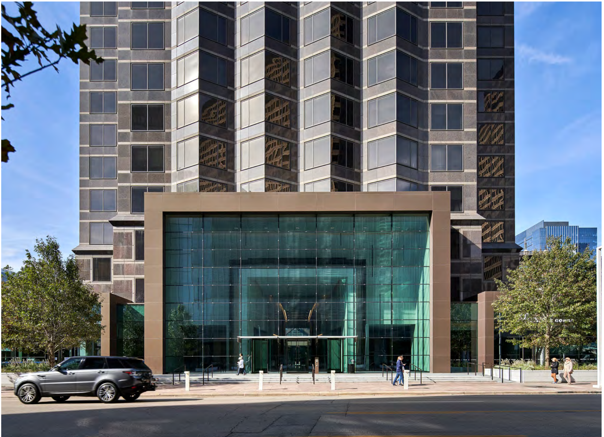
Ross Avenue Grand Façade