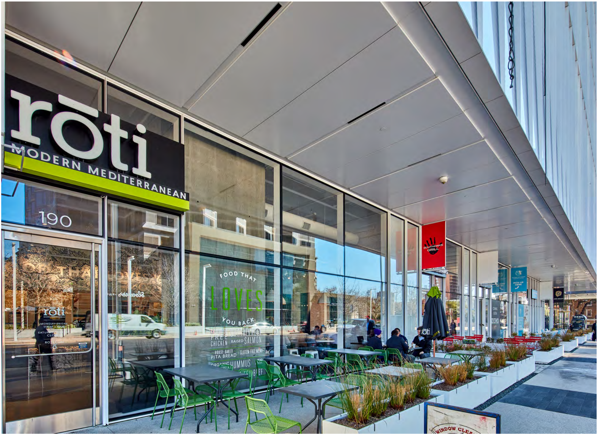
Ross Avenue Streetscape