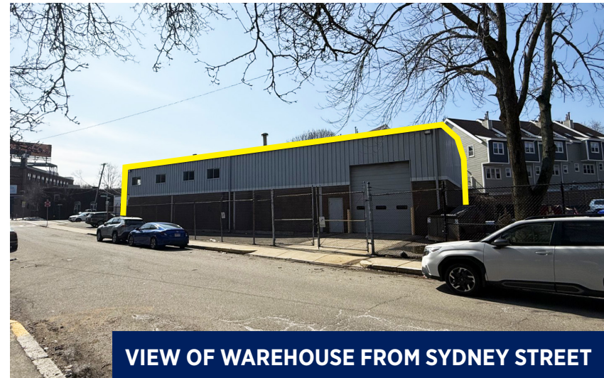
VIEW OF WAREHOUSE FROM SYDNEY STREET