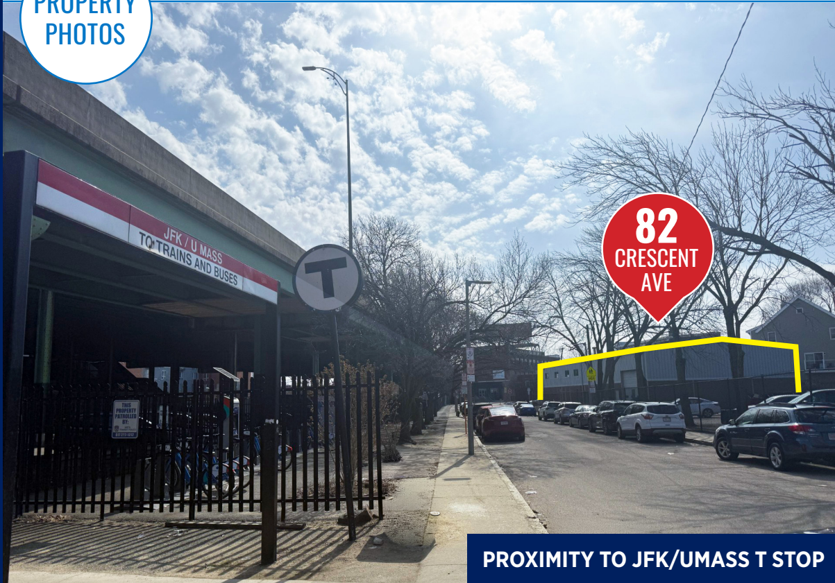
PROXIMITY TO JFK/UMASS T STOP