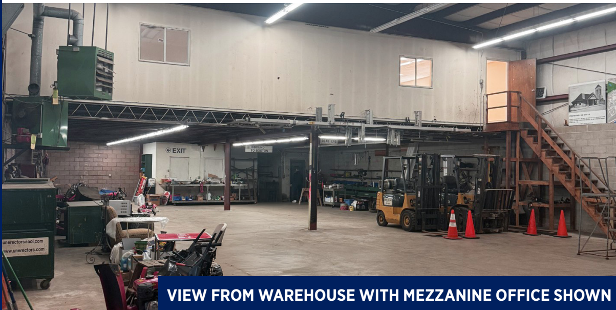
VIEW FROM WAREHOUSE WITH MEZZANINE OFFICE SHOWN