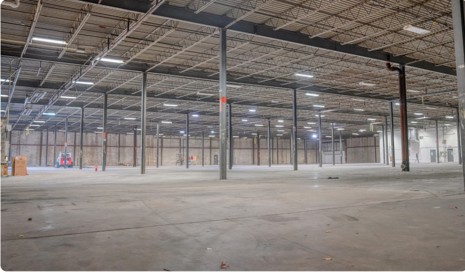
Interior walls removed