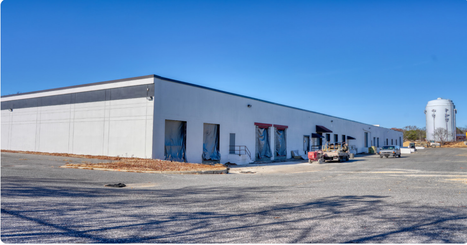
Four additional loading docks have been added