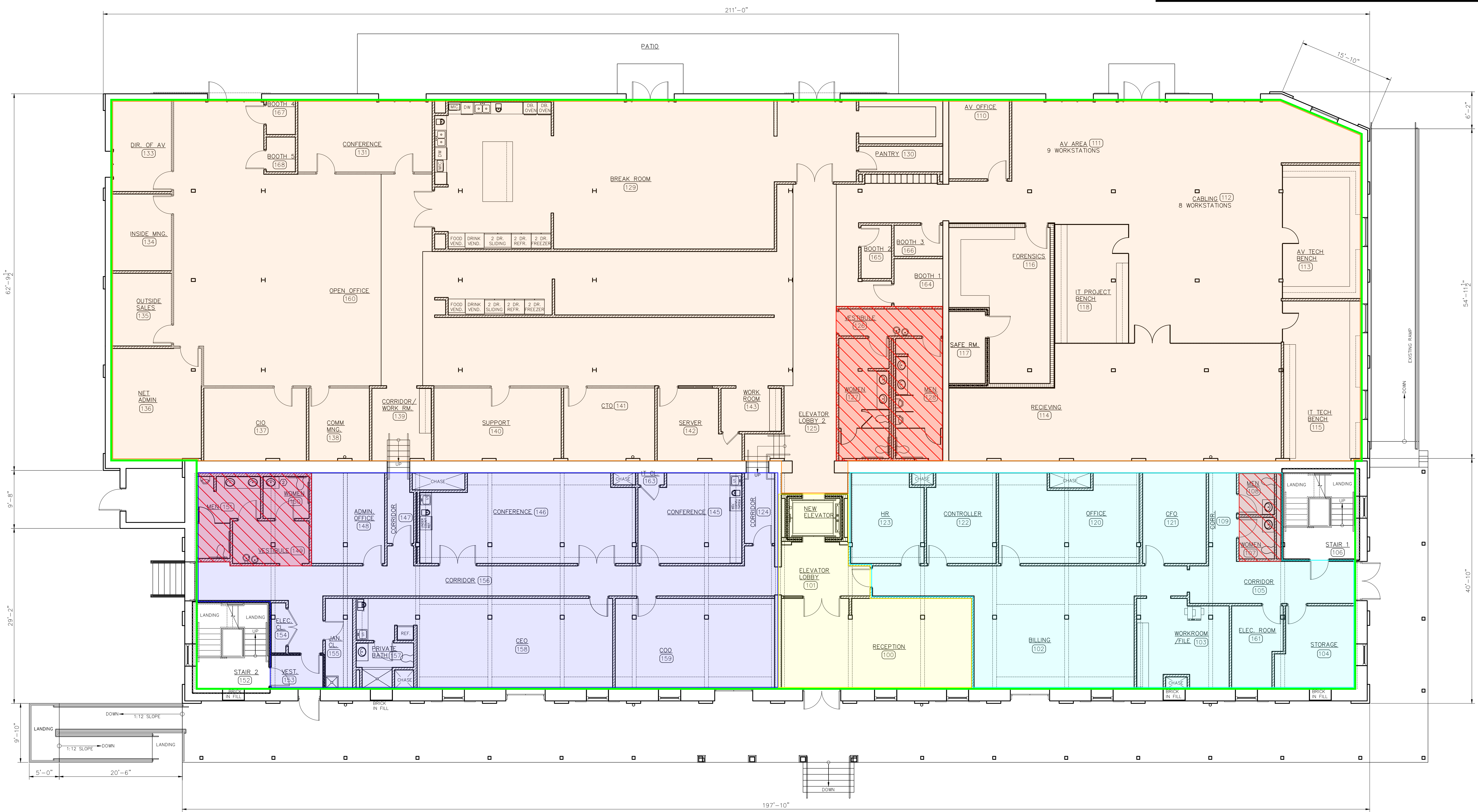
1 FIRST FLOOR PLAN A0.1 SCALE: 1/8" = 1'-0"