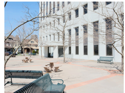
LARGE SHARED PATIO