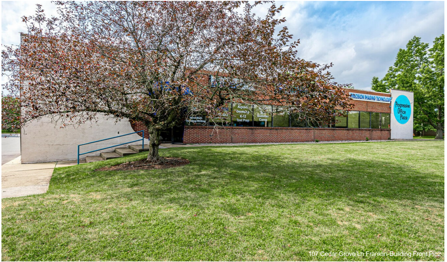
107 Cedar Grove Ln Franklin-Building Front Pic2