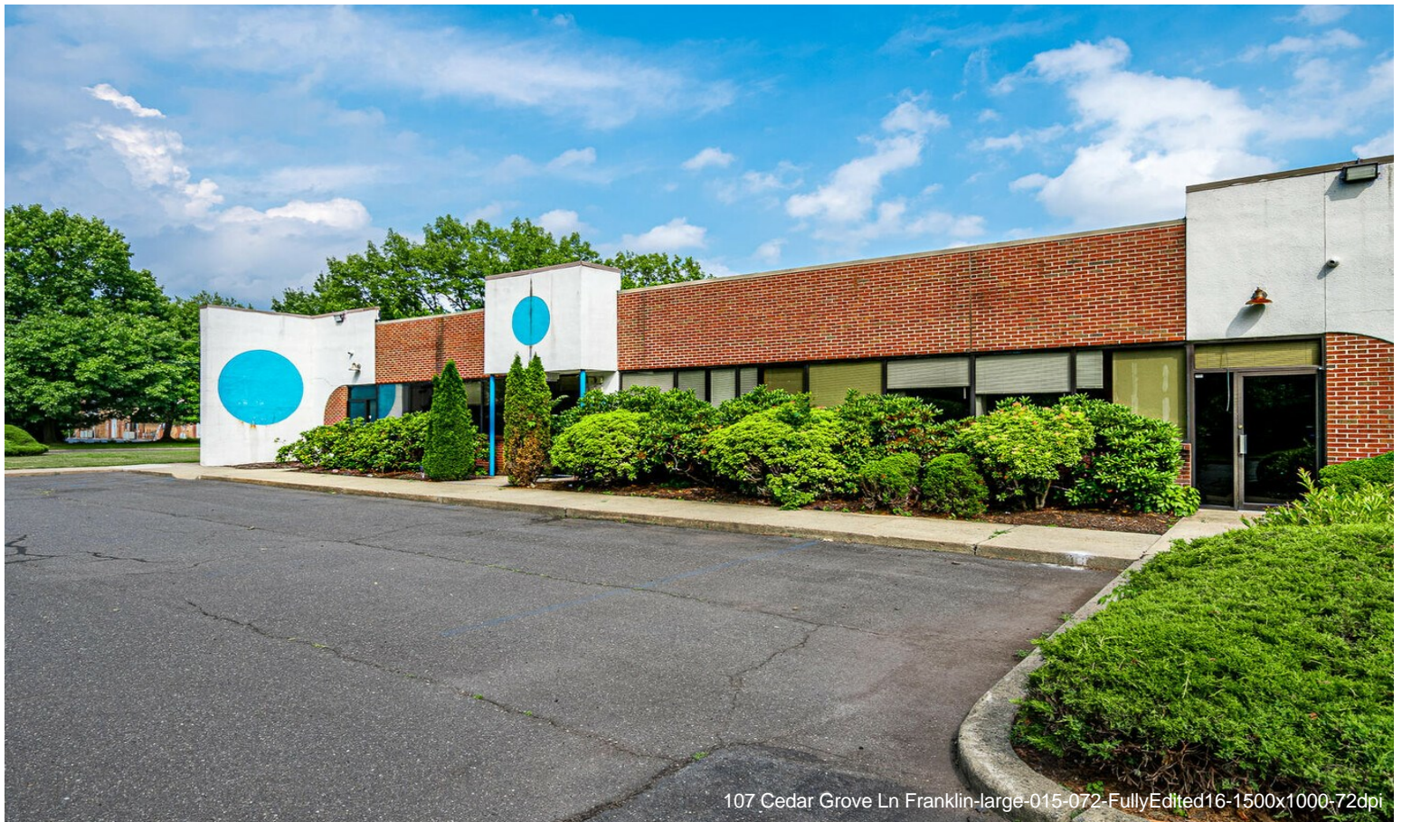
107 Cedar Grove Ln Franklin-large-015-072-FullyEdited16-1500x1000-72dpi