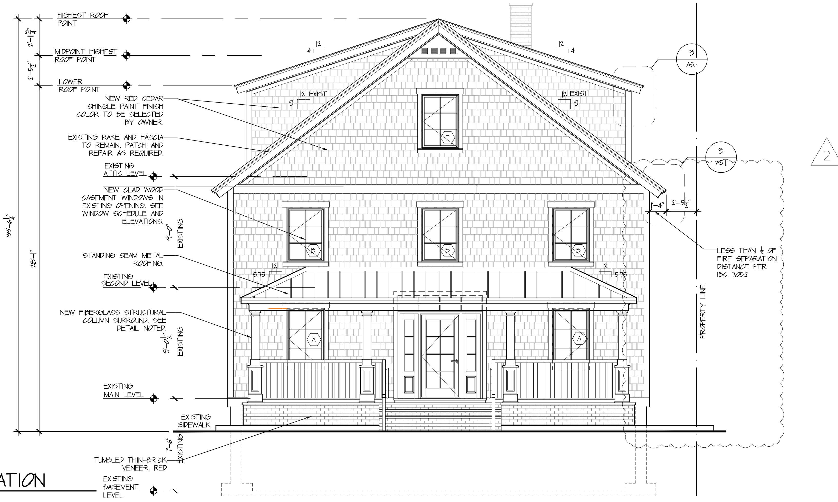
1 FRONT ELEVATION SCALE: 1/4"=1'-0"