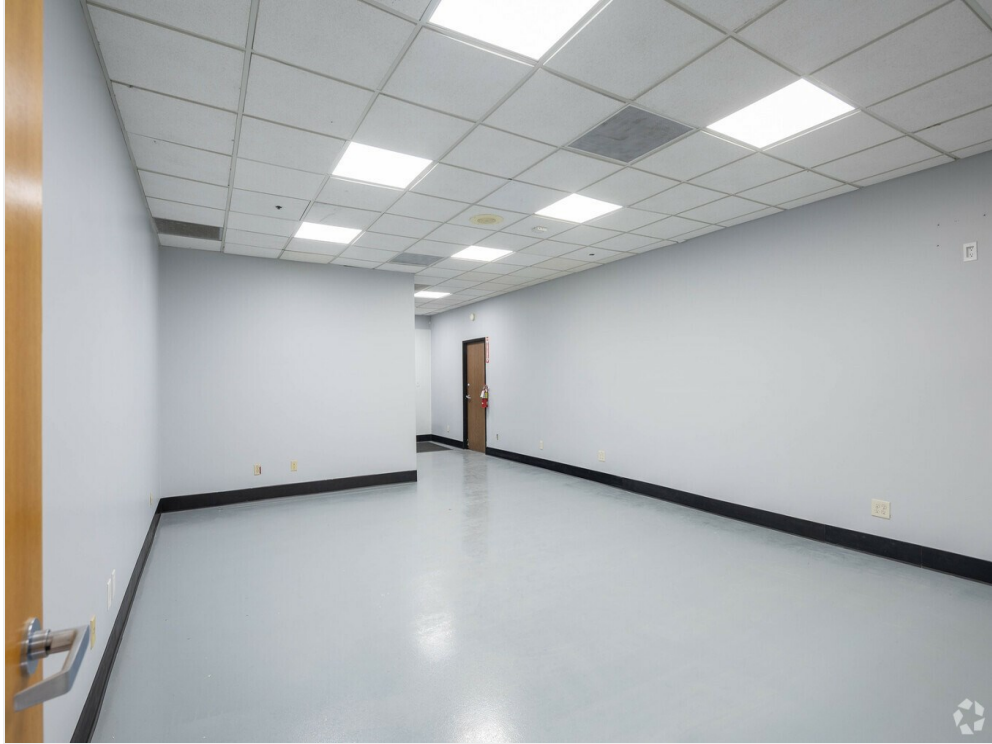
Kitchen - Now Available