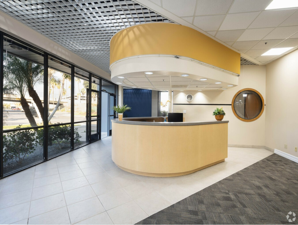
Front Lobby - Now Available