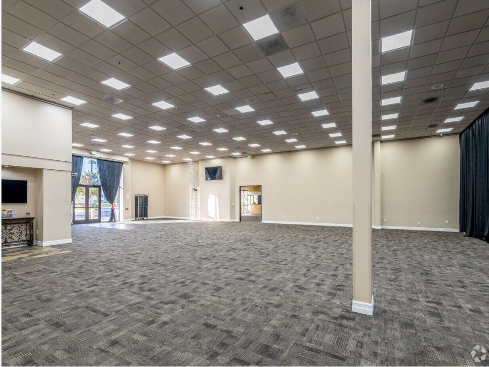
Showroom Space - Now Available