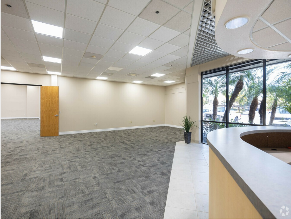
Front Lobby - Now Available