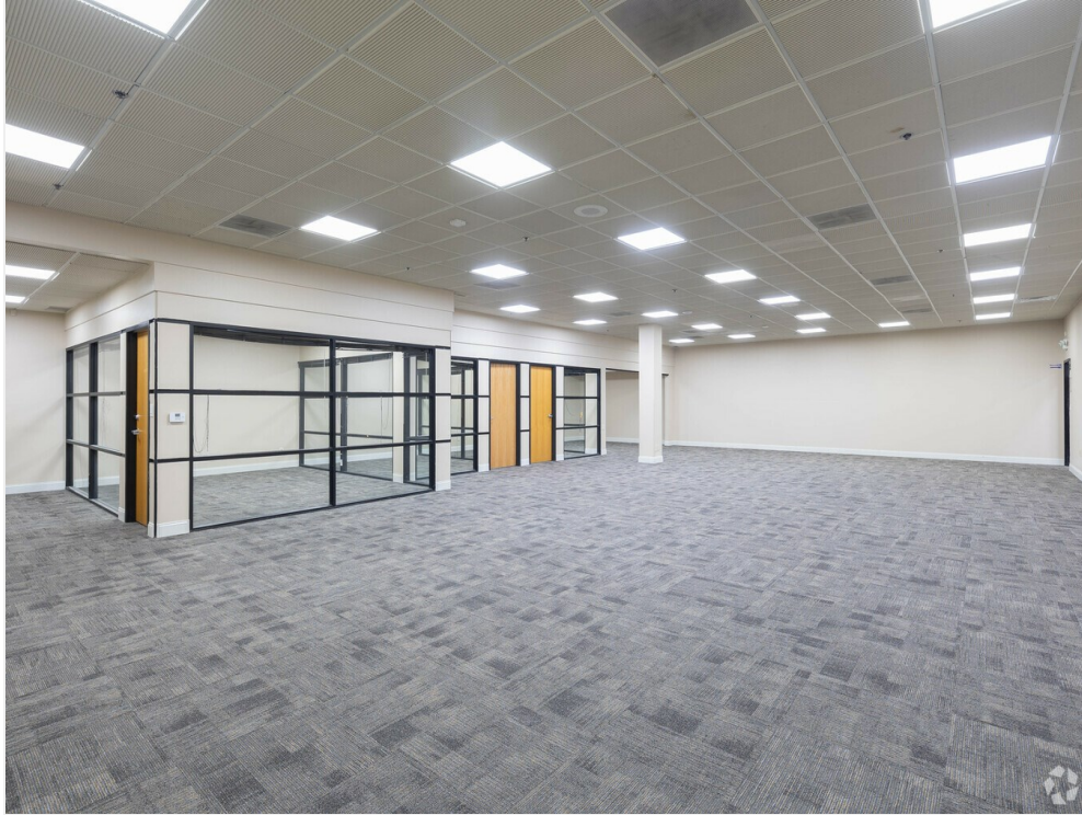
Open Area - Now Available