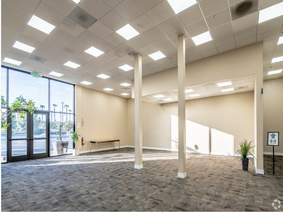
Showroom Space - Now Available