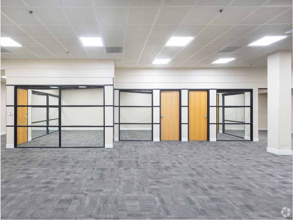
Open Area - Now Available