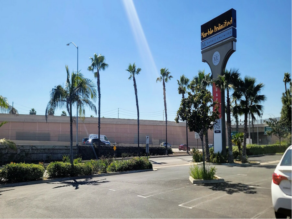
Freeway Sign / Anaheim Way Entrance