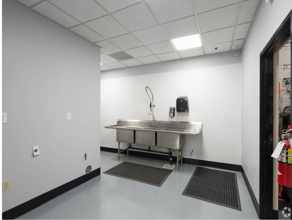
Kitchen - Now Available