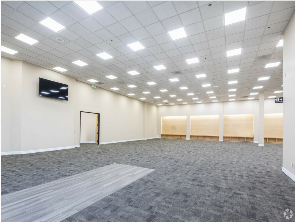
Open Area - Now Available