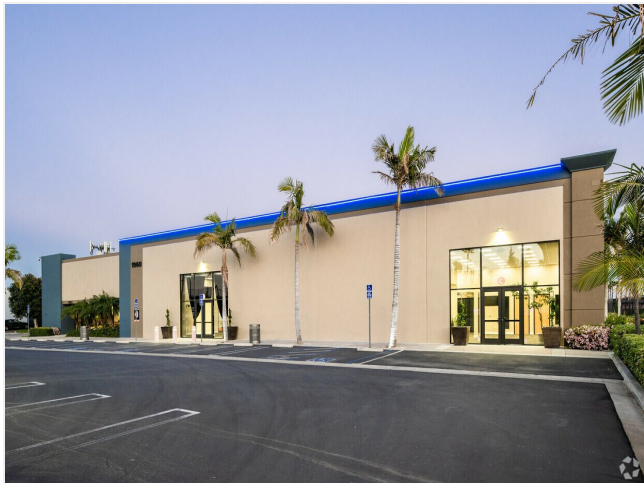
View From Main Parking Area