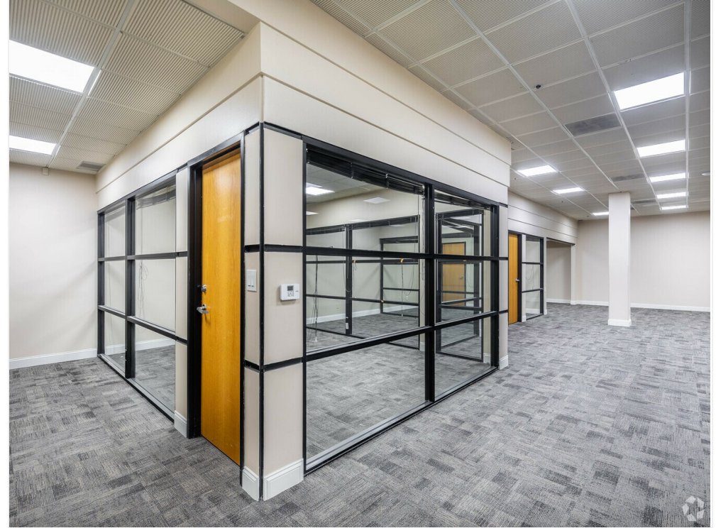
Office Space - Now Available