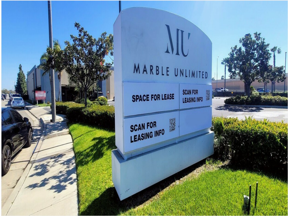
Monument Signs on both sides of the building - Available For Tenants Business Name