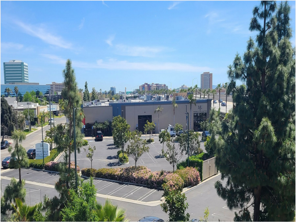
Onsite Free Parking