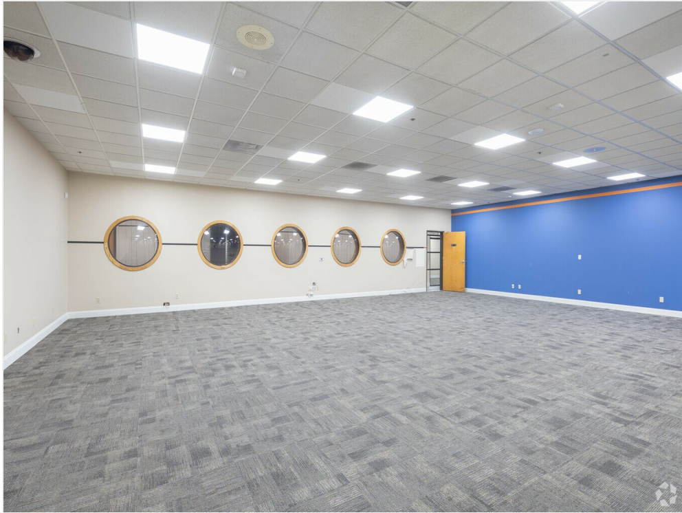
Open Area - Now Available