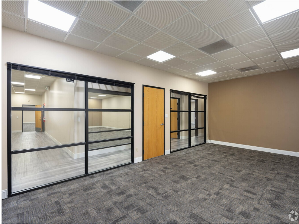
Office Space - Now Available