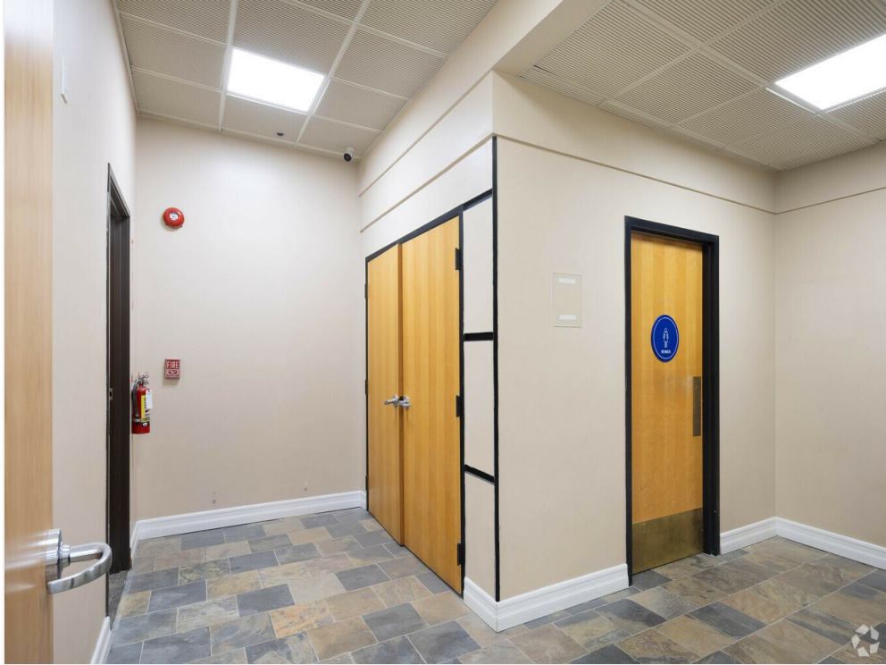
Open Area - Now Available