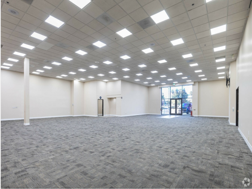
Open Area - Now Available