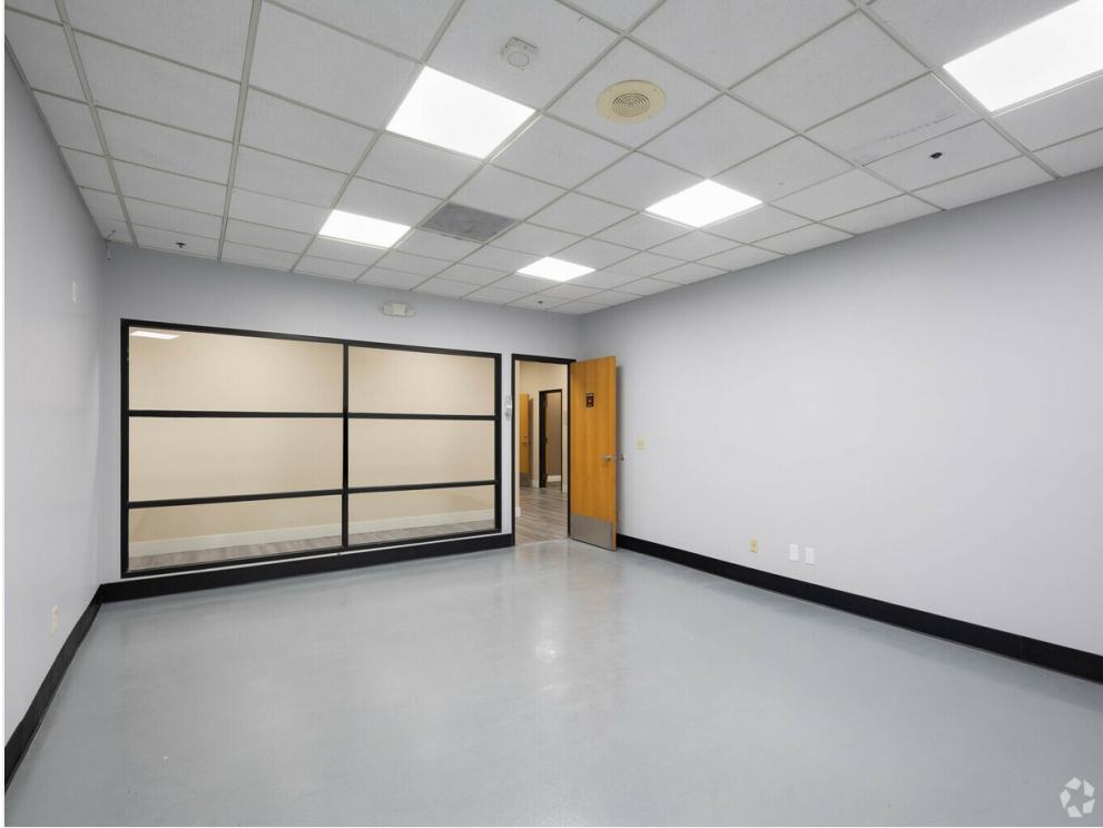
Kitchen - Now Available