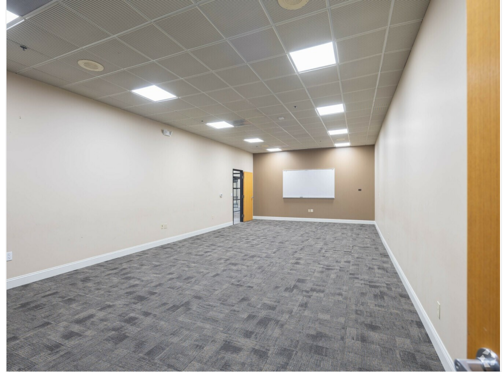
Open Area - Now Available