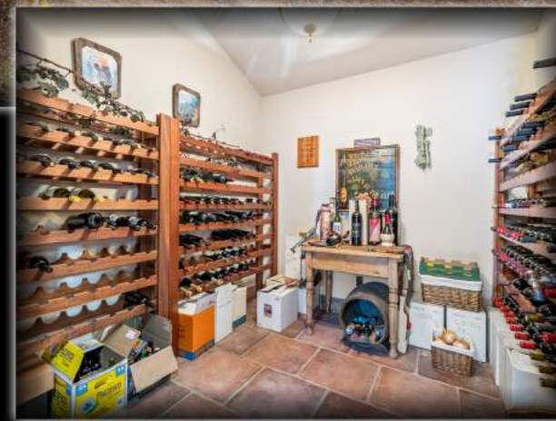
A covered breezeway leads from the kitchen to the 2-car garage, housing a finished, temperature-controlled wine storage room and a laundry room.