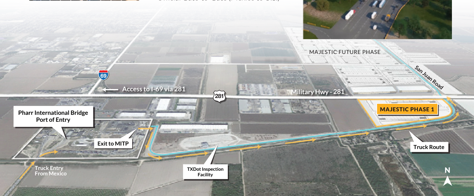
Pharr International Bridge Port of Entry