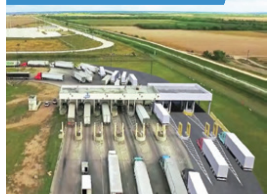
Expanded bridge facilities