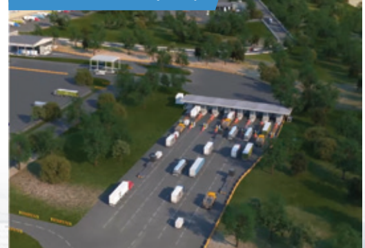
Increased truck capacity