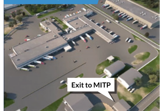
Exit to MITP