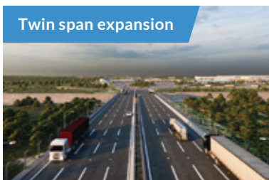
Twin span expansion

The Expansion Project will add a 'twin span' adjacent to the existing Bridge, essentially doubling its capacity.