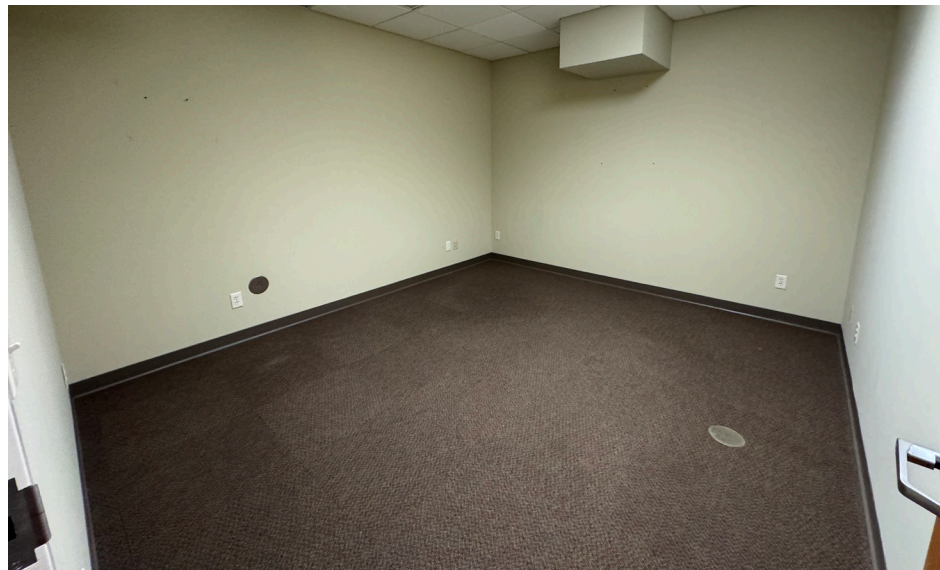
Private Office 2