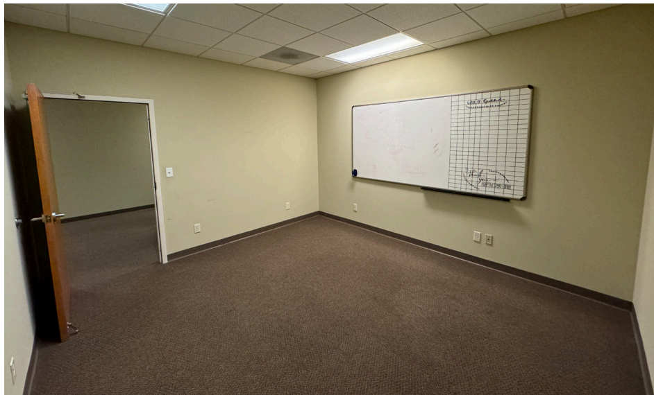
Private Office 1