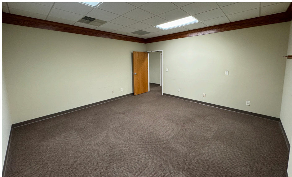
Private Office 3