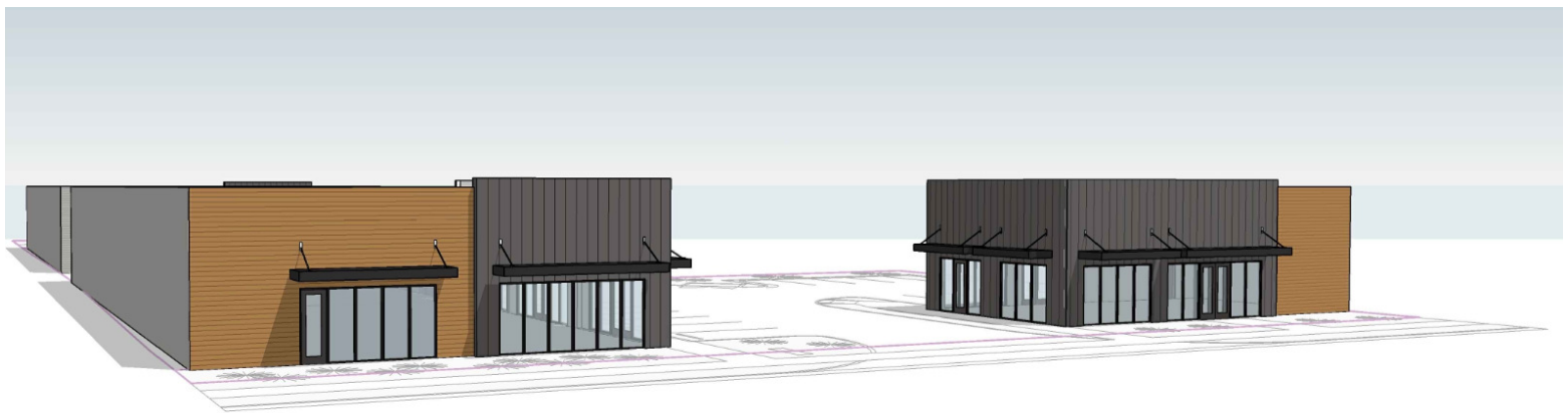
NORTHWEST STREET VIEW