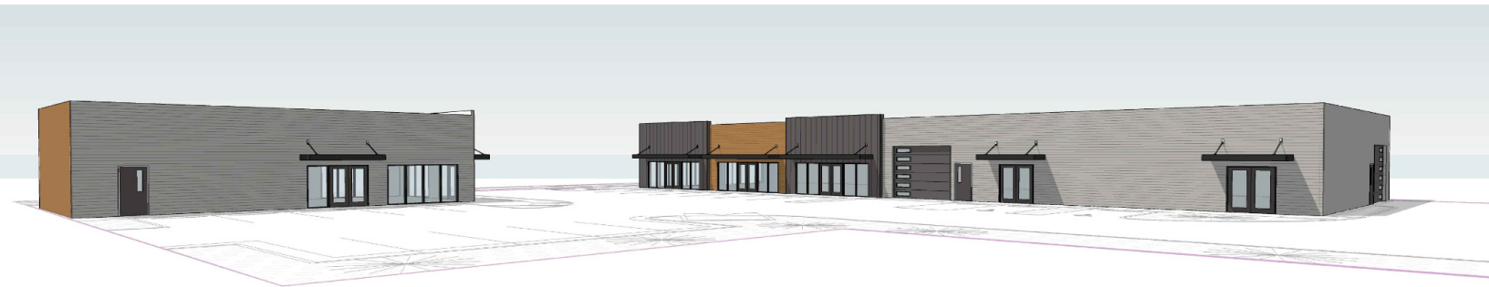
SOUTHEAST - BUILDINGS 1 & 2