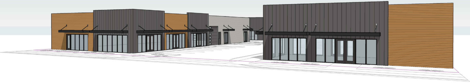
SOUTHWEST STREET VIEW