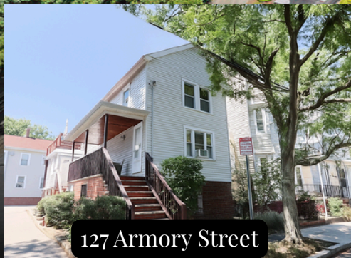
127 Armory Street