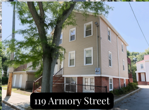
119 Armory Street