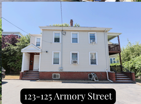
123-125 Armory Street