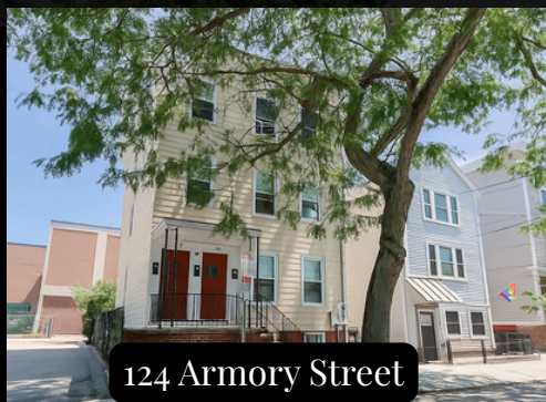
124 Armory Street