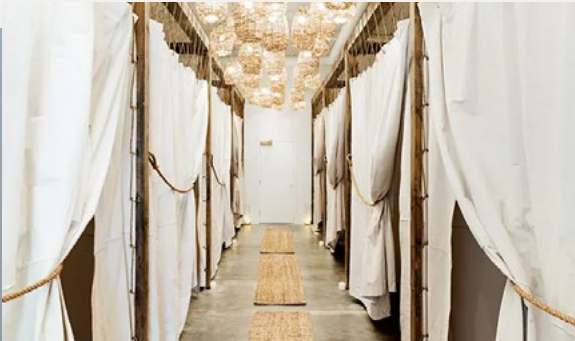
The Now Spa

Bunda is a lower body focus workout studio that integrates half stair master and half strength training. - Bunda