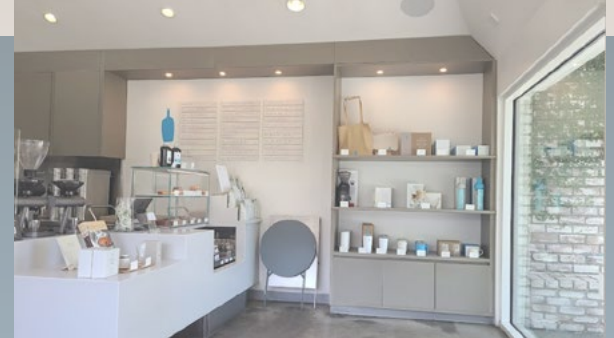
Blue Bottle Coffee

[solidcore] is a high-intensity, low-impact strength training workout on a custom-built reformer machine. It utilizes slow, controlled movements to push your muscles to the point of failure in order to build back stronger - Classpass