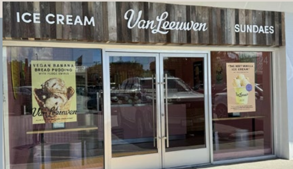
Van Leeuwen Ice Cream

Van Leeuwen Ice Cream is a popular artisanal brand known for its rich, French-style dairy ice cream (made with lots of egg yolks and high butterfat) and a popular line of vegan ice creams, using simple, high-quality ingredients. - Google