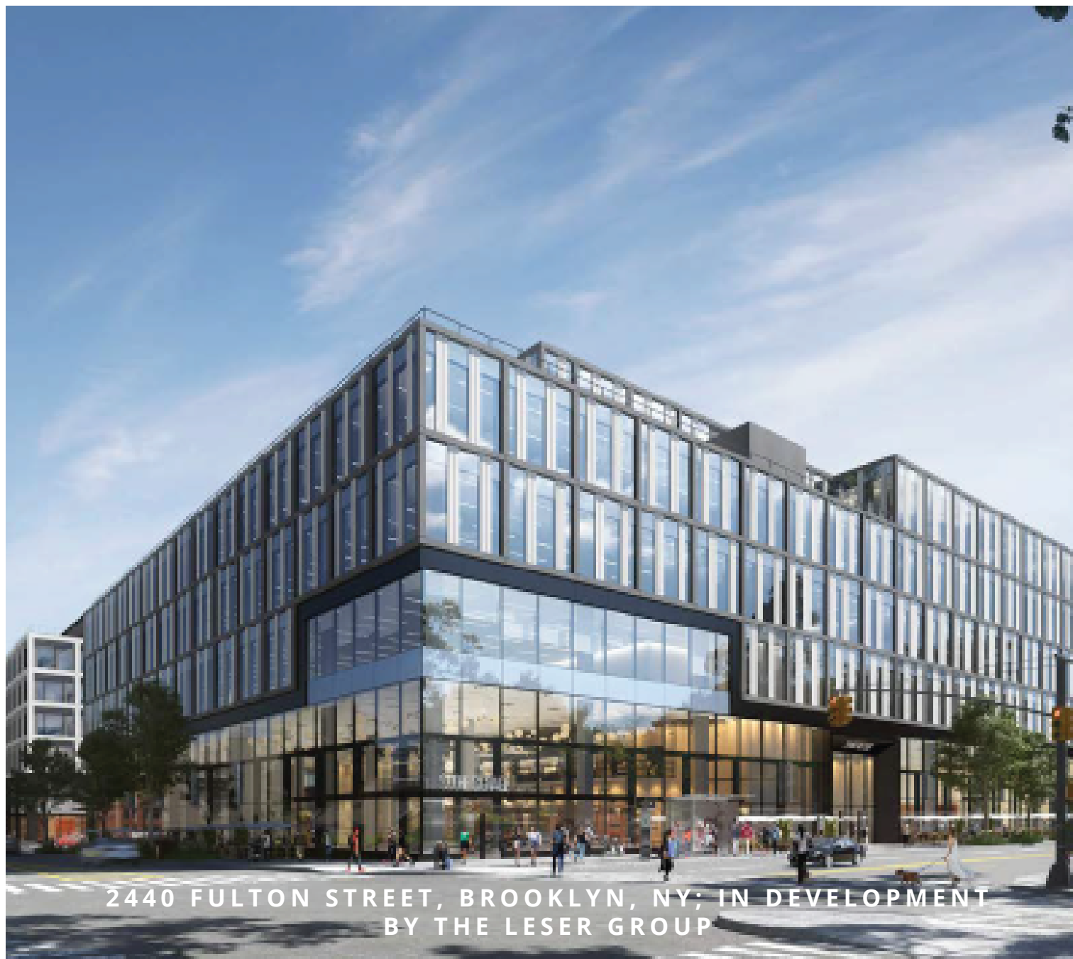
2440 FULTON STREET, BROOKLYN, NY; IN DEVELOPMENT BY THE LESER GROUP

The Leser Group, LTD is a venerable New York City real estate development and management company with an impressive portfolio in the greater metropolitan area and beyond. Founded by Abraham Leser in 1973, the firm has developed more than 50 projects over 50 years including five million square feet of commercial, industrial, office and residential properties with a market value totaling more than $1 billion. With a finger on the pulse of the communities it serves and insight into industry trends, the Leser Group's unique approach to development – coupled with its unparalleled ability to secure and retain tenants – remain critical components of its success since founding. The company's diverse portfolio includes real estate development, construction and management of commercial, office, government, residential and non-profit properties throughout the northeastern United States.